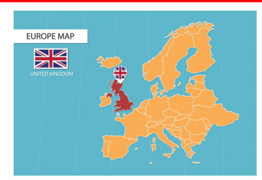
The United Kingdom (UK) has a population of 67 million people. It is half the size of Kenya.