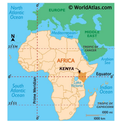
Kenya has a population of

57 million people. It is twice the size of the UK.